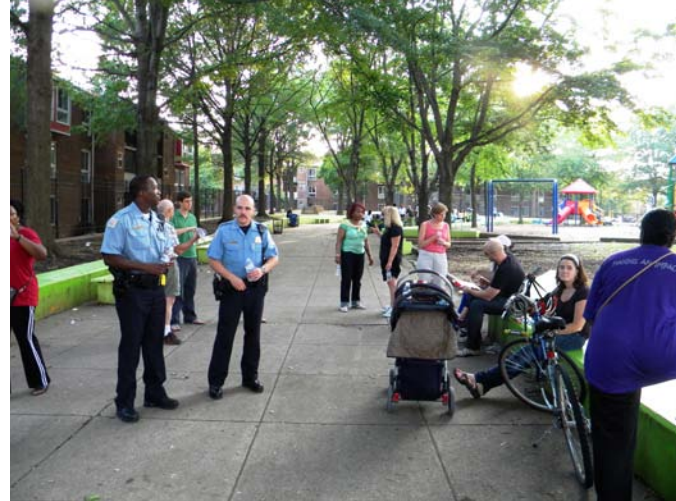
Metropolitan Police join community members in community walks.

We currently have volunteers for P ST, 1400 and 1500 block of First, 200 block of R and 1400 of NJ. Would you like to lead your block? Contact Geovani at Mrgeovani@aol.com