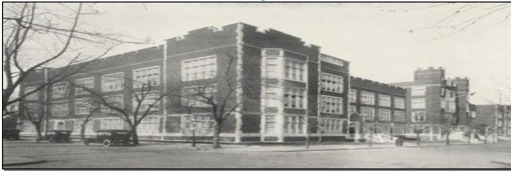
Dunbar Senior High School - 1916

The original Dunbar Senior High School was built in 1916. The school was located on First Street, between N and O Streets, NW. The school replaced the old M Street High School, the first permanent African – American high school in the country. 30