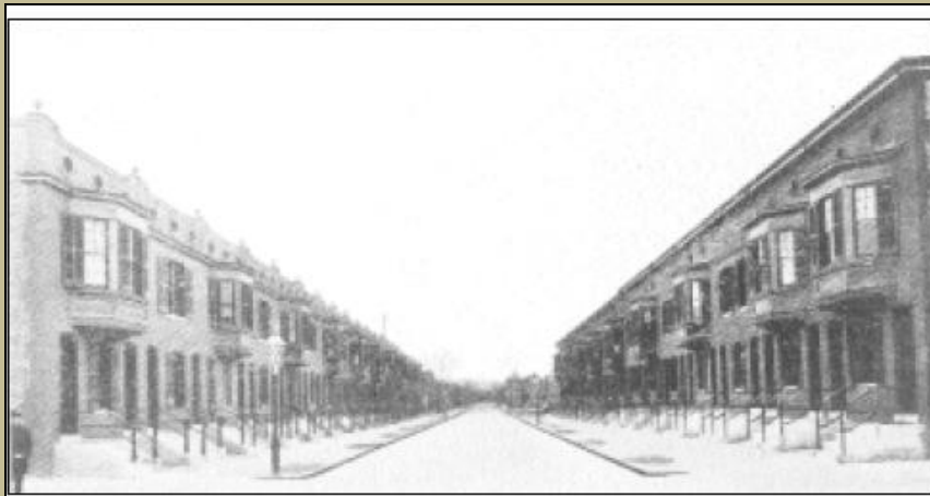
View of Bates Street, NW as seen shortly after the block was completed in 1901.