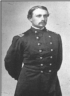
Robert Gould Shaw