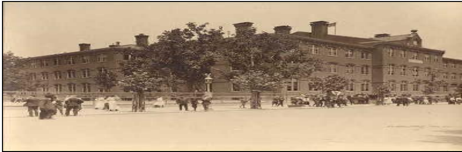
Central Senior High School