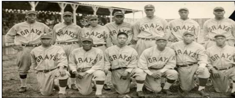
First African - American Baseball Team in the District of Columbia

Finally, by the mid-1880s to the early 1900s, African Americans in Shaw formed building associations such as the Industrial Building and Savings Company, Oak Park Realty Company and the Capital Savings Bank of Washington, the first African - American –owned bank in the United States. 19