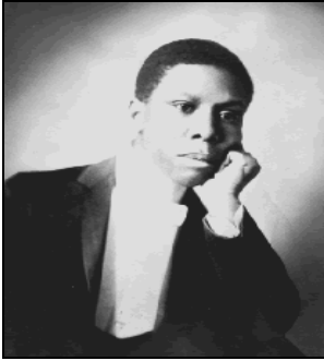
Paul Laurence Dunbar